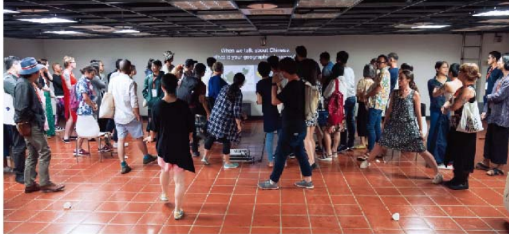
Lecture presentation review, photo from Taipei Performing Arts Center.

2: As two artists who grew up in mainland China, they believe that they live in a distorted "internal world," and that the relative "outside world" is also another distorted world. Both of these constitute a double-distorted world. Wandering life makes them switch from inside to outside. Is this a step closer to reality? Are the puzzles of "What is Chinese?" always going with them to the end of the journey?