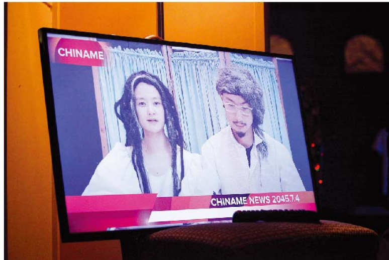
Performance review, TV news made by XIAO KE x ZI HAN.

Is Chinese a community of imagination or is it real?