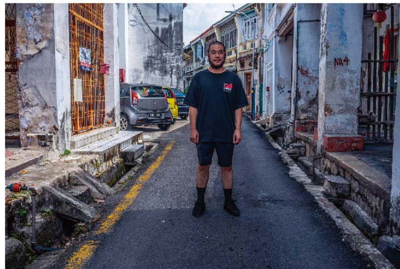
Portrait of CHINAME project interviewee_Kingston, in Penang, Malaysia.