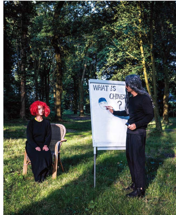
Posters(on page 3 and 5) for CHINAME Germany and Netherlands version 2018.

1: Some scholars believe that the nation has existed since the early human history. Other scholars believe that the nation is a product of modernity and is created for the purpose of economic and political interests. It is related to the contemporary context of the national framework and expressly expresses its recognition in relation to domestic or foreign policies. For example, it is a “community of interest” for the recognition of immigration or migration policies.